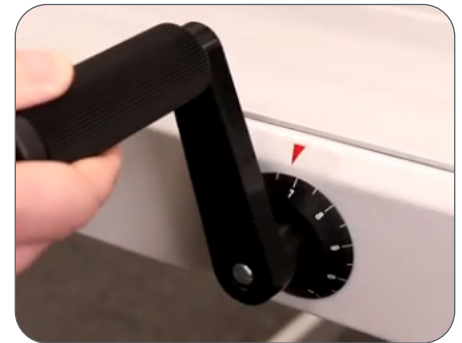
Back gauge crank