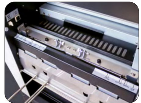
Slide paper size adjustment guides