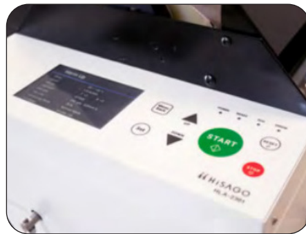
Color screen and controls