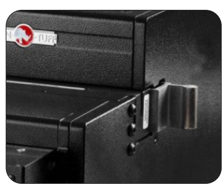
EZ change die system