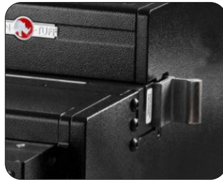
EZ change die system