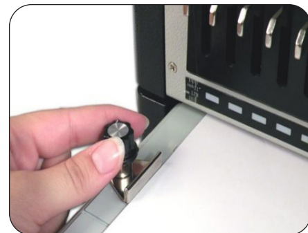
Depth margin control