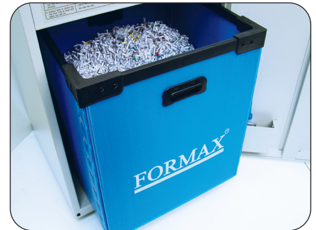
Lifetime guaranteed molded plastic waste bin