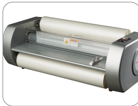
Hot roller infrared technology