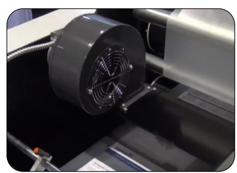
High powered cooling fans