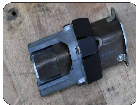
Change out dies