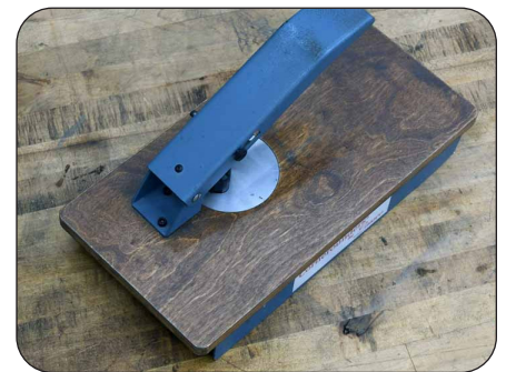
Solid wood top plate