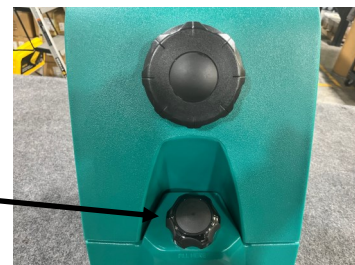
Fill Port Area