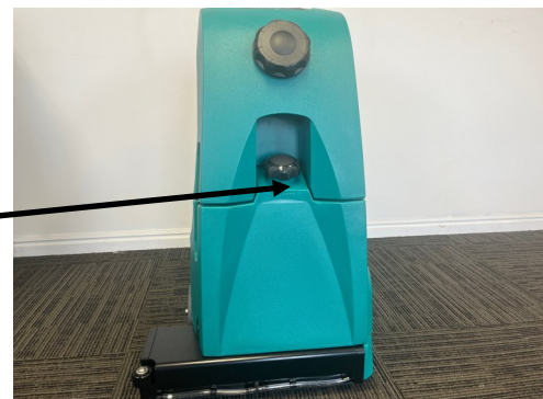
Fill Port Area