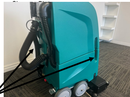
Buckle Latches (3)

Purpose: This seal is to prevent water from flowing into the vacuum cavity when overfilling the solution tank. This will extend the life of your vacuum motor.