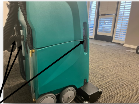
Buckle Latches (3)

Purpose: This seal is to prevent water from flowing into the vacuum cavity when over-filling the solution tank. This seal will help preserve the life of the vacuum motor.