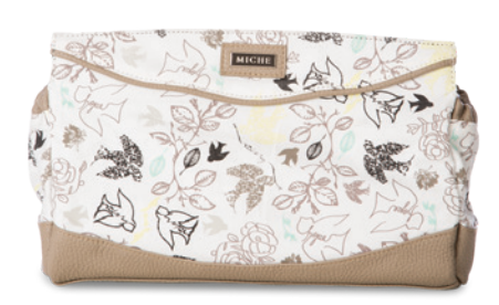
HOPE DOVE classic

Printed abstract flowers in canvas, plum faux leather with a creamy background and oversized silver dome head studs. $42.95 shell only