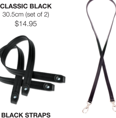
(set of 2) SHORT MEDIUM 53cm 58cm $14.95 $14.95