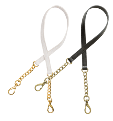
MINI WHITE CROC WITH GOLD HANDLE MINI ANTIQUE WITH BRASS HANDLE