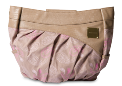
HOPE PAISLEY demi

Large pink paisleys feature a script "hope" word. Light taupe canvas with faux leather lizard detail. $64.95 shell only