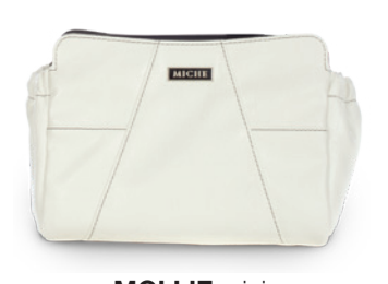
MOLLIE mini Creamy white textured faux leather and black stitching detail with angular lines. $34.95 shell only