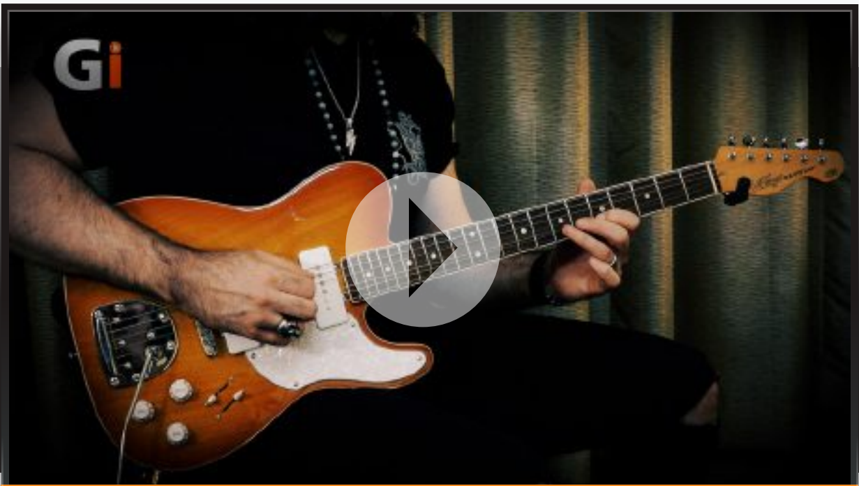
Vintage – Revo Trio

PERHAPS in spite of their name, Vintage Guitars are never ones to rest on their laurels. Never content just to put out affordably priced and shockingly good takes on classic instruments, the reigning British heavyweight champions of “affordable guitars” are constantly looking for cool new takes on timeless designs and player-approved “quality of life” upgrades.