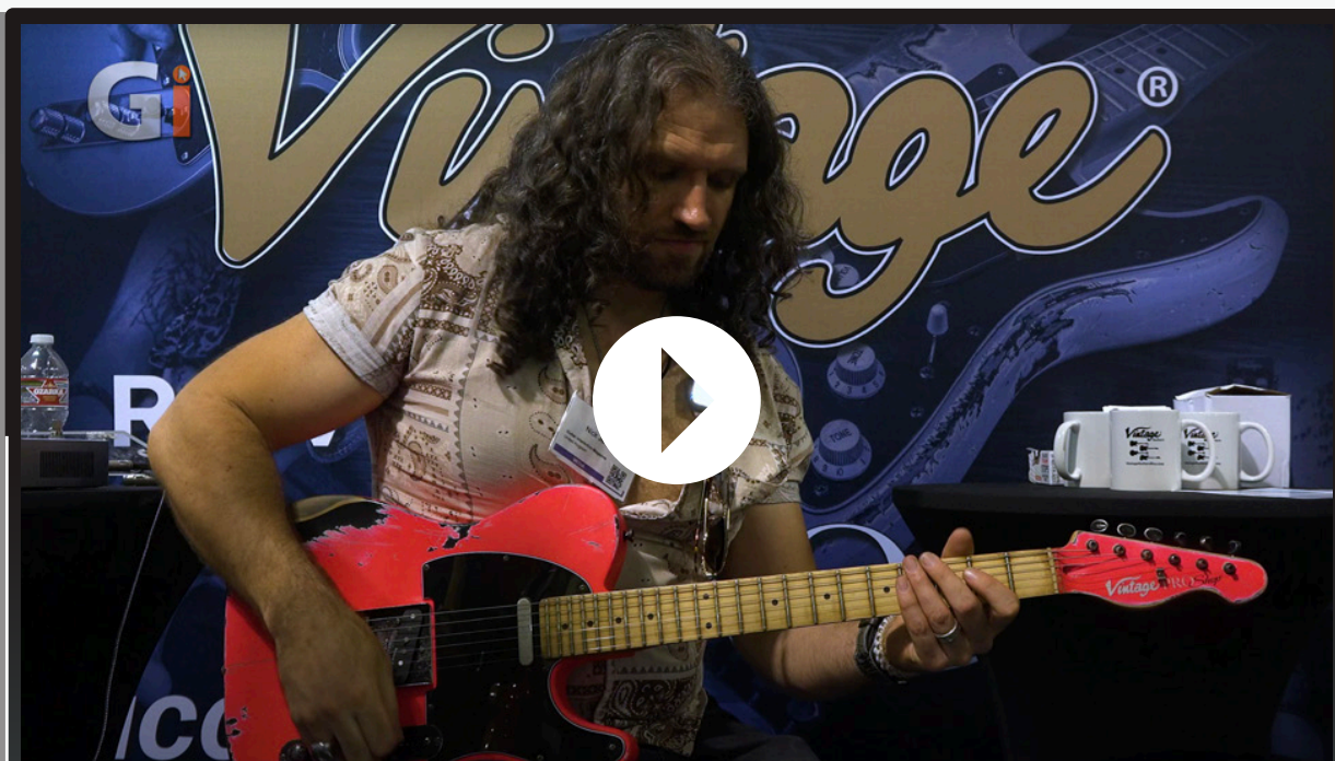
Vintage ProShop V75 Unique