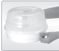
Ensure that tray and lid are securely fastened by the two locks.