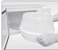
Put the sterilizer into the microwave oven and sterilize for 7 minutes. Do allow the unit to cool down for at least 5 minutes before taking it out.