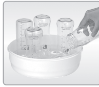
Fill the tray with 100ml of clean water.