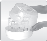
Cover with the lid.