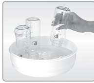
Place the thoroughly washed bottles and accessories into the tray upside down.