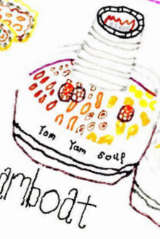
Tom Yam Soup