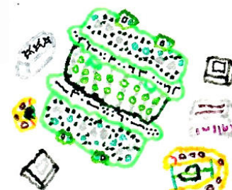
White Chocolate Pistachio