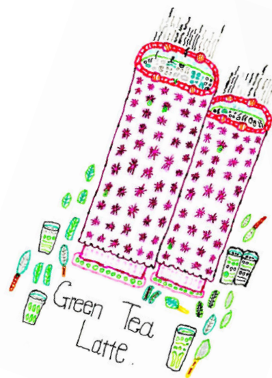
Green Tea Latte