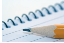
Paper and writing instrument OR print out this sheet