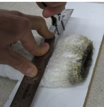
Figure 5-Box knife cutting of silencer Packing.

the Can to hold the assembly in place. To position measurement tool, set the end of the Can on a flat surface (Figure 3), this will push the measurement tool flush with the end of the Can for correct measurement location. Remove the 2 screws & slide the Perforated Tube out of the Can being careful not to move the measurement tool or O-ring. Using a sharpie marker mark the circumference of the Perforated Tube on the side of the O-ring closest to the Inlet Cap (Figure 4).