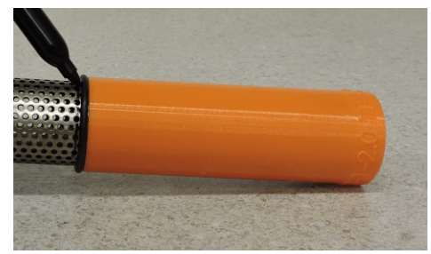
Figure 3-Installation tool being positioned by setting the end of the Can on flat surface. Figure 4-Sharpie marking cut location.

6) Using the provided tubular measurement tool (orange for 250-300cc & white for 125-150cc) & O-ring, measure & mark the Perforated Tube for cut location. Begin by sliding the O-ring & then measurement tool onto the Perforated Tube so that the tool is roughly 1" past the end of the Perforated Tube (Figure 2). Next install the inlet assembly back into the Can. Install 2 of the Inlet Cap screws on opposite sides of