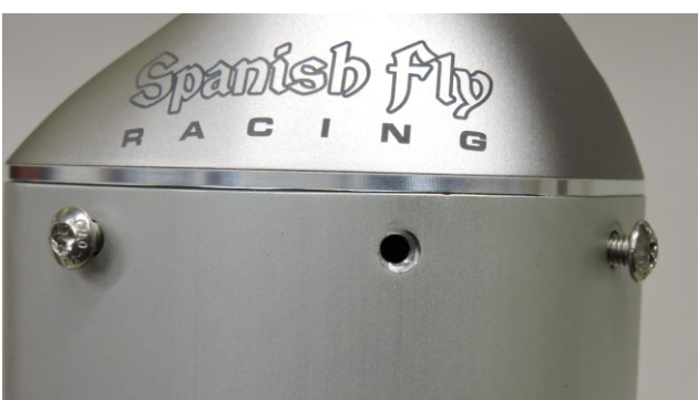
Figure 6-Checking screw hole locations in Can.

7) Being careful not to crush the Perforated Tube, mount it in a vice & cut ON the sharpie mark, if anything, err on leaving the Perforated Tube a little longer than the mark suggests. Round the sharp edges of the cut, both on the inside & outside of the tube using a file, this will ease installation later.