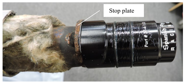
Figure 5-Adapter correctly positioned on exhaust tube.