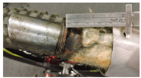
Figure 6- Measurement of stop plate to end of silencer.

7) Apply silicone sealant to the surface of the end cap that will interface with the silencer body, this will act as an assembly lubricant & help seal the gap between the two parts. Slide end cap over the adapter & begin assembly by introducing the lower edge of the end cap (Ref. white arrow in Figure 7) into the silencer body. Tap lightly with a rubber mallet at the top end of the end cap to persuade the top edge of the end cap into the silencer body. If the bike is new and the end cap has not been exposed to many exhaust heat cycles; using a heat gun to warm up the inside of the end cap where it meets the adapter will aid in assembly.