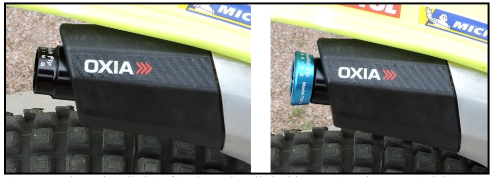
Figure 7-Adapter installed (Left), adapter installed with TRS-1 spark arrestor (Right).

8) Re-install the three endcap screws, final installation should look like Figure 7 below. Now smile & go ride a section!