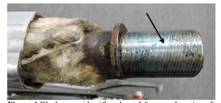
Figure 4- Black arrow identifies cleaned & greased portion of exhaust tube.