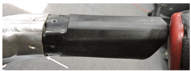
Figure 6-Re-installation of end cap beginning with lower edge identified by white arrow.

7) Apply silicone sealant to the surface of the end cap that will interface with the silencer body, this will act as an assembly lubricant & help seal the gap between the two parts. Slide end cap over the adapter & begin assembly by introducing the lower edge of the end cap (Ref. white arrow in Figure 7) into the silencer body. Tap lightly with a rubber mallet at the top end of the end cap to persuade the top edge of the end cap into the silencer body. If the bike is new and the end cap has not been exposed to many exhaust heat cycles; using a heat gun to warm up the inside of the end cap where it meets the adapter will aid in assembly.