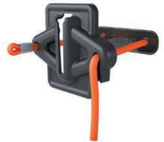
Magnetic cord strap holder/receiver PRODUCT CODE: CORD01