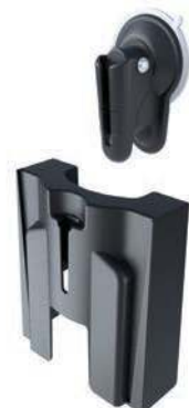
Skipper suction pad support bracket