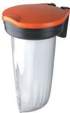
Skipper recycle bin PRODUCT CODE: BIN01.