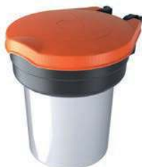
Skipper safety dispenser PRODUCT CODE: DISP01