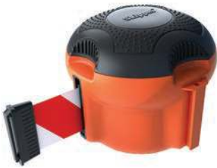
The Skipper XS unit PRODUCT CODE: XS01.