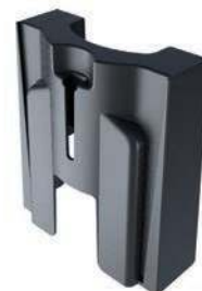
Suction pad support bracket PRODUCT CODE: P/SUPPORT01