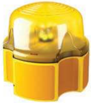
Rechargeable safety light PRODUCT CODE: LIGHT01