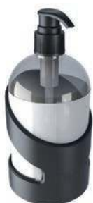
Sanitiser bracket PRODUCT CODE: SAN01