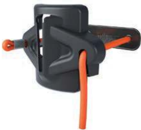
Curved cord strap holder/receiver PRODUCT CODE: CORD02