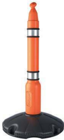
Post & base system PRODUCT CODE: POST01 (POST), POST02 (BASE)