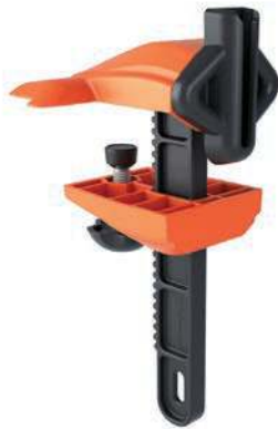
Clamp holder/receiver PRODUCT CODE: CLAMP01