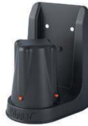
Skipper wall & magnetic support brackets PRODUCT CODE: W/SUPPORT01 (WALL VERSION), M/SUPPORT01 (MAGNETIC VERSION)