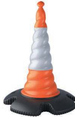
Skipper road cone PRODUCT CODE: CONE01