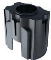
Post & base collar PRODUCT CODE: POST04