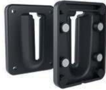
Skipper wall & magnetic receiver clips PRODUCT CODE: W/RECEIVER01 (WALL VERSION), M/RECEIVER01 (MAGNETIC VERSION)