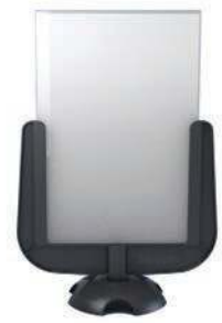
Skipper A4 sign holder PRODUCT CODE: SIGN01