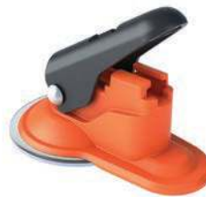
Suction pad holder/receiver PRODUCT CODE: PAD01