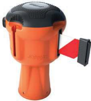
The Skipper unit PRODUCT CODE: SKIPPER01.