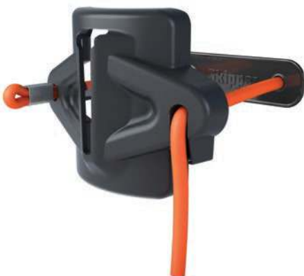
Skipper cord strap clip (magnetic)