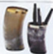
Desktop efficiency "Black Flair pens in horn cups, in quantities."