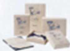
Pinesider stationery "Mine is pale blue with red pinstripes."