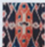
Strong prints "I love something graphic—an ikat or a stripe."