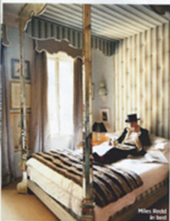
Miles Redd in bed

Miles Redd infuses old-world charm with new-school vitality