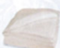
Schwaitzer linens "Their white sheets with three-line gray embroidery."