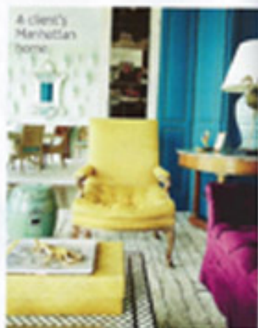
A client's Manhattan home