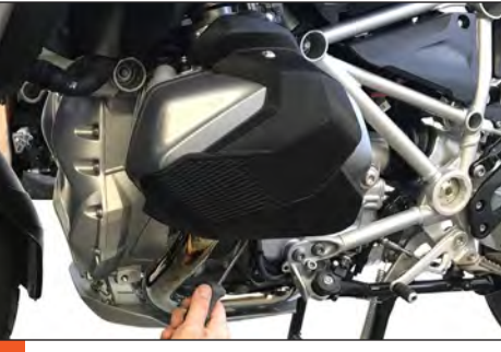
6 Tighten all screws evenly with a T25 Torx driver. Do not over-tighten!