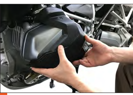
3 Place X-Head into position.