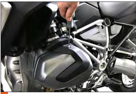
Remove one T25 Torx screw retaining the spark plug cover. Remove cover.

WARNING AND DISCLAIMER: All parts manufactured, designed or sold by Machineart Moto("MaMo") should be installed by a qualified motorcycle technician, Injury is increased by improper installation or misuse of equipment. MaMo's customers must exercise good judgment in the use, control, alteration, part selection and installation, and maintenance of their motorcycles. In the event of a possible defect in material or design, or any other defect in a part manufactured, designed or sold by MaMo, the responsibility of MaMo is limited to a refund of the purchase price or the replacement of the part if MaMo determines the part to be defective, and subject to MaMo's inspection of the part within thirty (30) days from the date of purchase. (Note: any attempted repairs or modifications made to MaMo custos will wish this limited warranty). MaMo, under no circumstances will be responsible for incidental and/or consequential damages, property damage, personal injury damage, or damage, injury, cost or expense of any kind or nature whatsoever except as provided by law. MaMo makes no other warranty, express or implied, including without limitation any warranties of merchantability and fitness for a particular purpose.