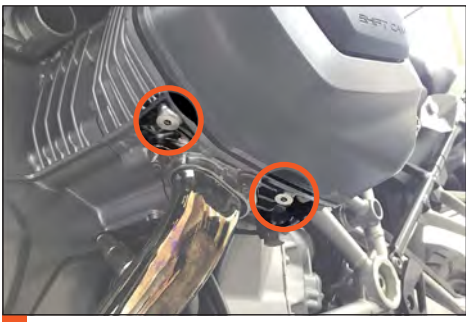
2 Before installation, identify the two lower mounting points.