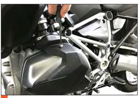
Align the upper mounting hole with the mount on the engine, and fasten with one T25 Torx screw.