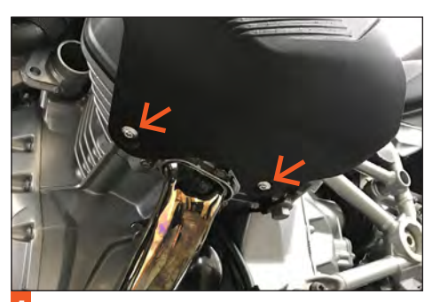
Fasten the X-Head with the supplied T25 Torx screws, starting at the bottom. Do not tighten! Be careful not to cross-thread the screws.