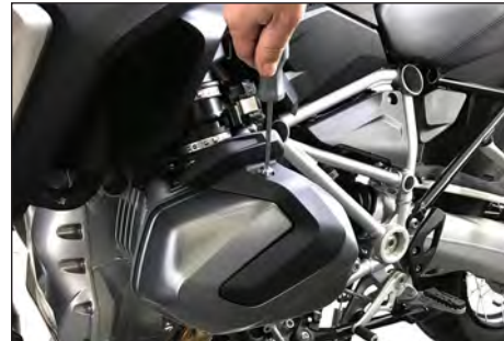
1 Remove one T25 Torx screw retaining the spark plug cover. Remove cover.

WARNING AND DISCLAIMER: All parts manufactured, designed or sold by Machineart Moto ("MaMo") should be installed by a qualified motorcycle technician. Injury is increased by improper installation or misuse of equipment. MaMo's customers must exercise good judgment in the use, control, alteration, part selection and installation, and maintenance of their motorcycles. In the event of a possible defect in material or design, or any other defect in a part manufactured, designed or sold by MaMo, the responsibility of MaMo is limited to a refund of the purchase price or the replacement of the part if MaMo determines the part to be defective, and subject to MaMo's inspection of the part within thirty (30) days from the date of purchase. (Note: any attempted repairs or modifications made to MaMo products will void this limited warranty). MaMo, under no circumstances will be responsible for incidental and/or consequential damages, property damage, personal injury damage, or damage, injury, cost or expense of any kind or nature whatsoever except as provided by law. MaMo makes no other warranty, express or implied, including without limitation any warranties of merchantability and fitness for a particular purpose.