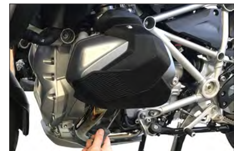
6 Tighten all screws evenly with a T25 Torx driver. Do not over-tighten!