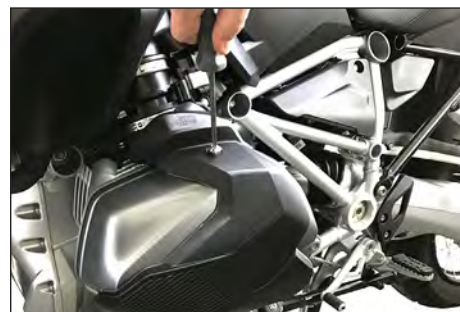
5 Align the upper mounting hole with the mount on the engine, and fasten with one T25 Torx screw.