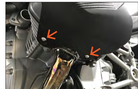
4 Fasten the X-Head with the supplied T25 Torx screws, starting at the bottom. Do not tighten! Be careful not to cross-thread the screws.