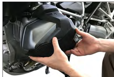
3 Place X-Head into position.