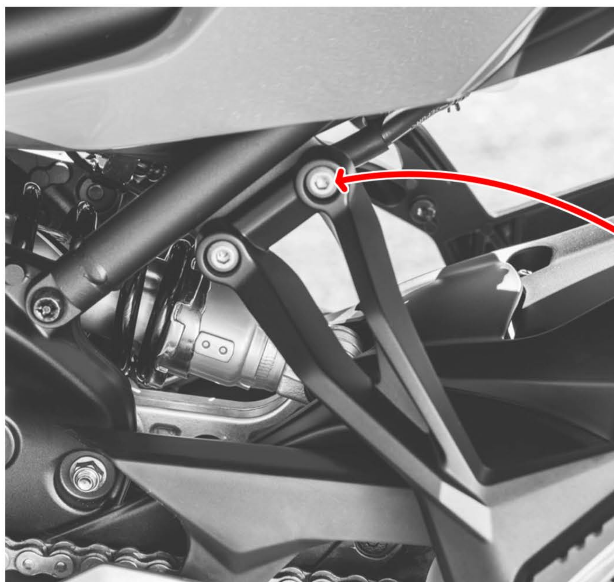
Rear footpeg mounting bolts