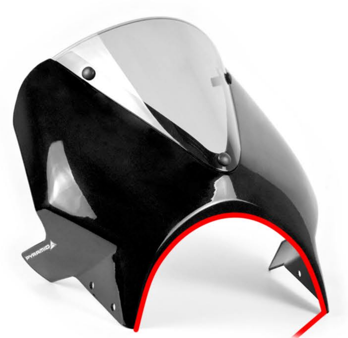
Rubber trim fitted around edge