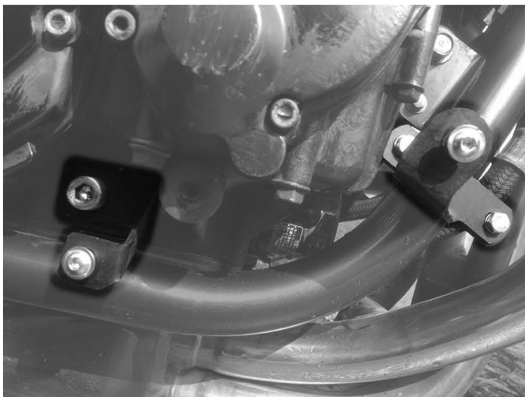
Right-hand side of bike