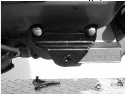
right hand bracket