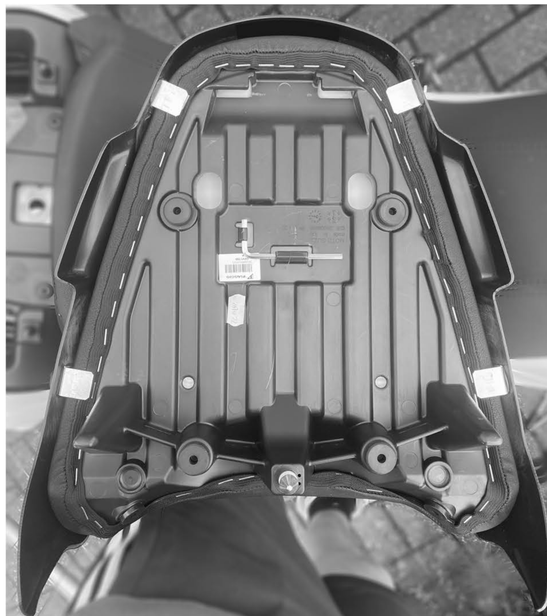
View of underside of seat with cowl fitted.