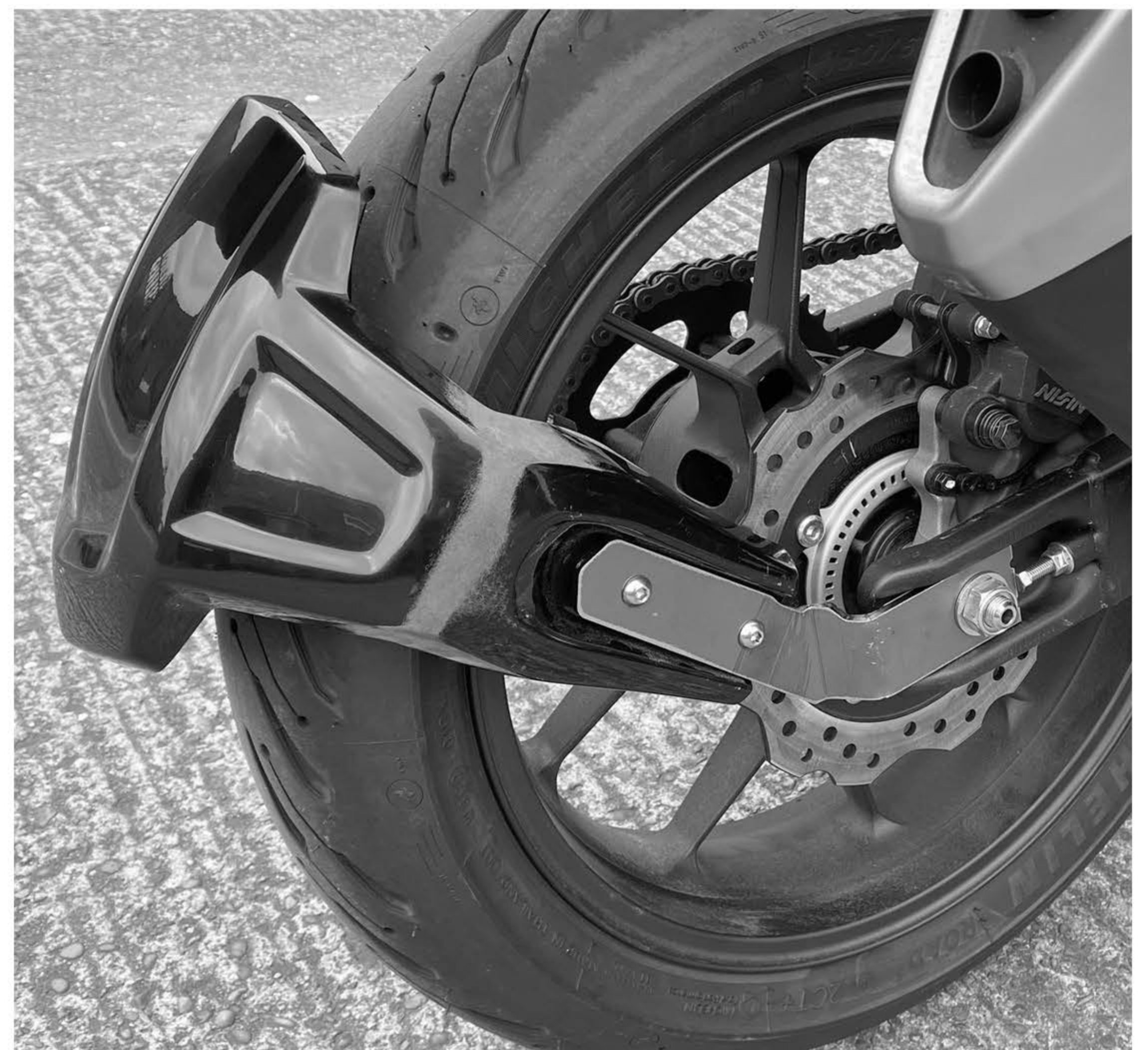
Prototype product fitted

sales@pyramid-plastics.co.uk +44 (0)1427 677990 www.pyramid-plastics.co.uk