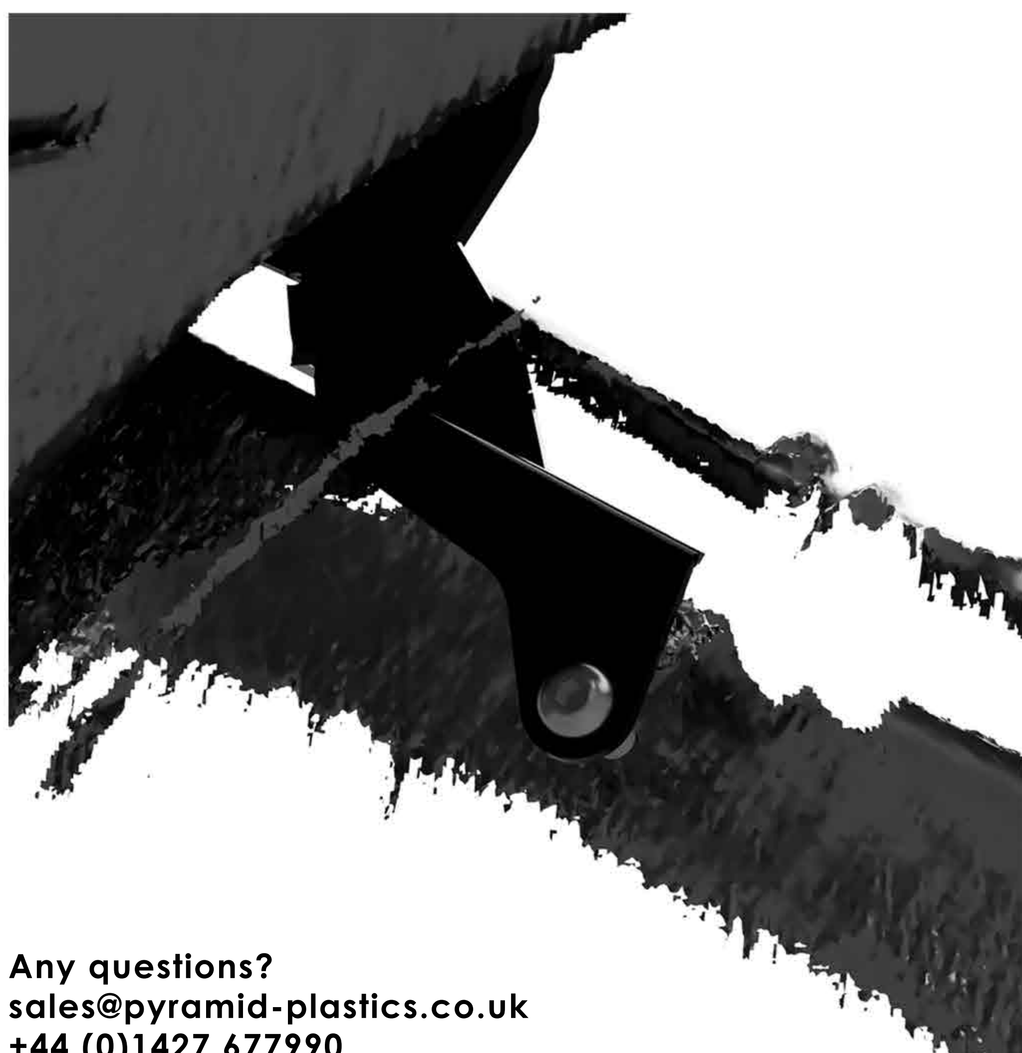
Figure 2 details where the bracket should be fitted, together with the OEM M6 screw.

Please take note of the orientation of the bracket.