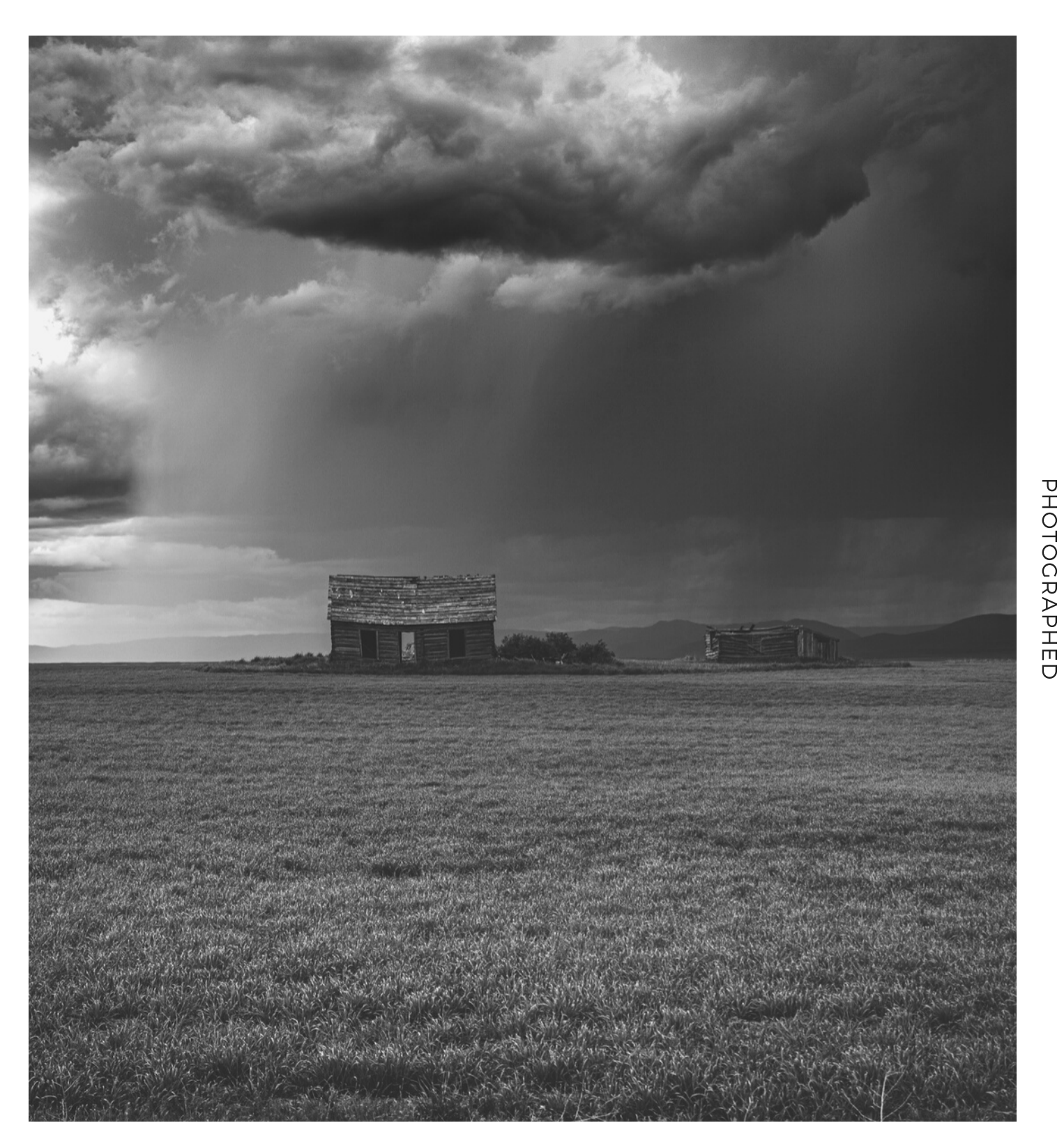
BY JONO MELAMED