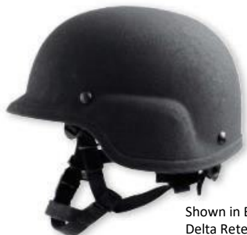
Shown in Black with Delta Retention System with Safariland RPS Liner