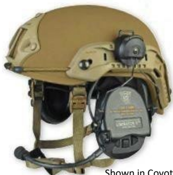
Shown in Coyote Brown High Cut with Delta Retention System with Safariland RPS Liner, Shroud, Rails, Bungee, and TCI Liberator II Communications System