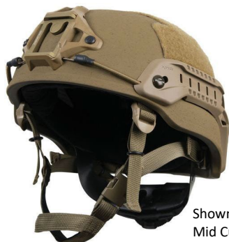
Shown in Coyote Brown Mid Cut with R2S Mesh Ratchet System, Shroud, Rails, Bungee, Velcro®.

4-Hole Bolted Pattern U.S. Army ACH Geometry - Three Cuts