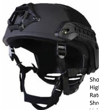
Shown in Black High Cut with R2S™ Ratchet System, Shroud, Rails, and Accessories

4-Hole Bolted Pattern ACH Style comes in Three Cuts