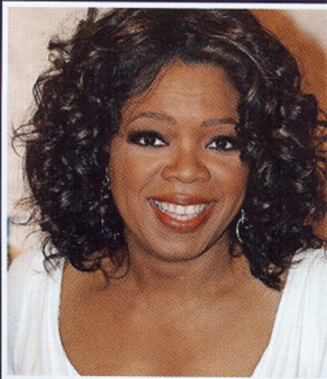
OPRAH WINFREY GENEROSITY'S ARCHANGEL

GIORGIO ARMANI HOSTS A LONDON NIGHT TO REMEMBER