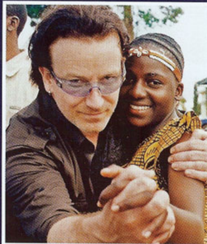
BONO THE HEART AND SOUL OF AFRICAN AID