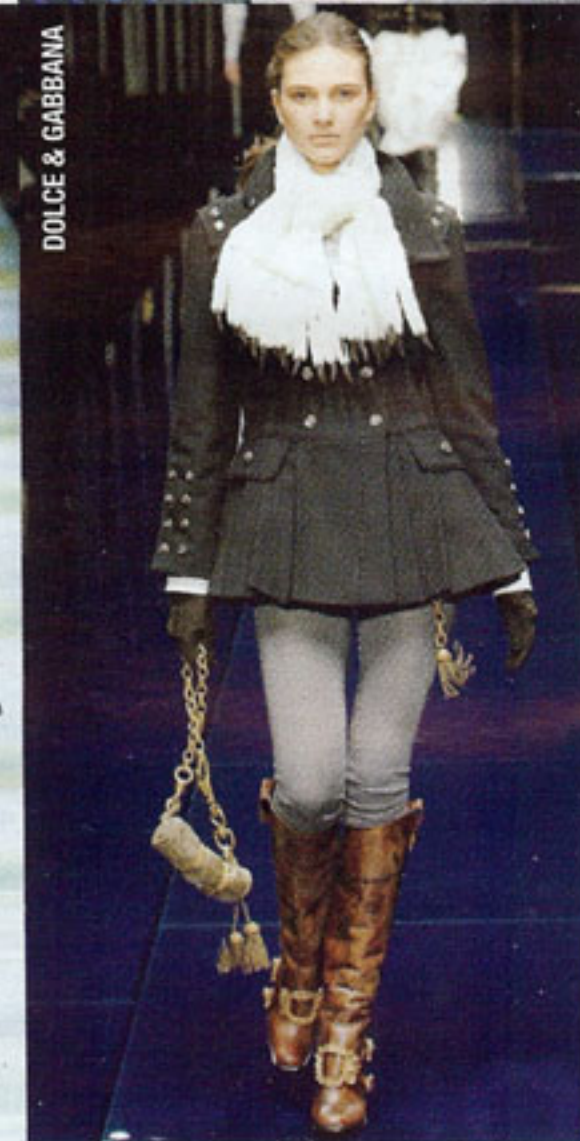
DOLCE &amp; GABBANA