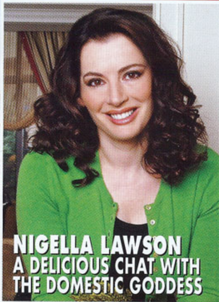
NIGELLA LAWSON A DELICIOUS CHAT WITH THE DOMESTIC GODDESS