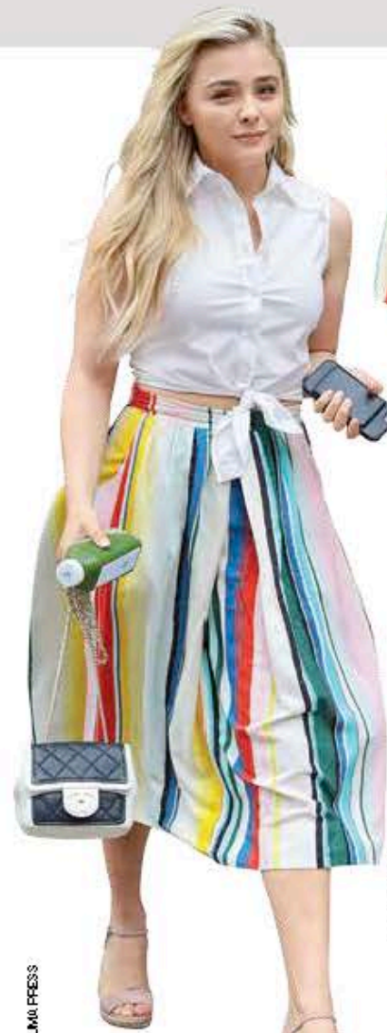
Chloë Grace Moretz shows off a colourful, summer-appropriate take on the striped skirt.