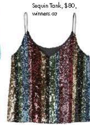
Sequin Tank, $80, winners.ca