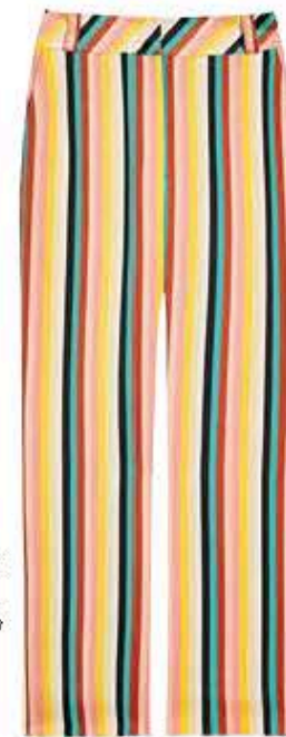
Rainbow Striped Wide Leg Trousers, $80, topshop.com