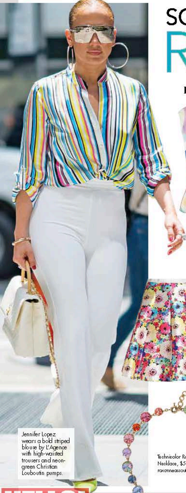
Jennifer Lopez wears a bold striped blouse by L'Agence with high-waisted trousers and neon-green Christian Louboutin pumps.

Why choose one hue when you can have them all? Brighten up your wardrobe with a kaleidoscope of colour