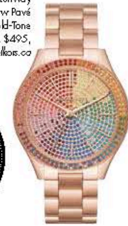
Slim Runway Rainbow Pavé Rose Gold-Tone Watch, $495, michaelkors.ca

STYLE TIP Punch up neutrals with multicolored accents, like a stacked heel or a watch face.