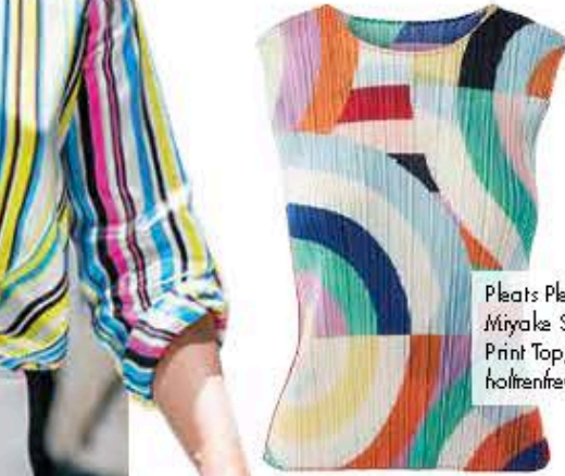
Pleats Please Issey Miyake Sleepy Print Top, $375, hollandfrew.com