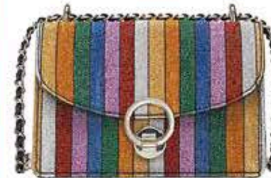
Striped Multicolor Mini Crossbody Bag, $46, zara.com