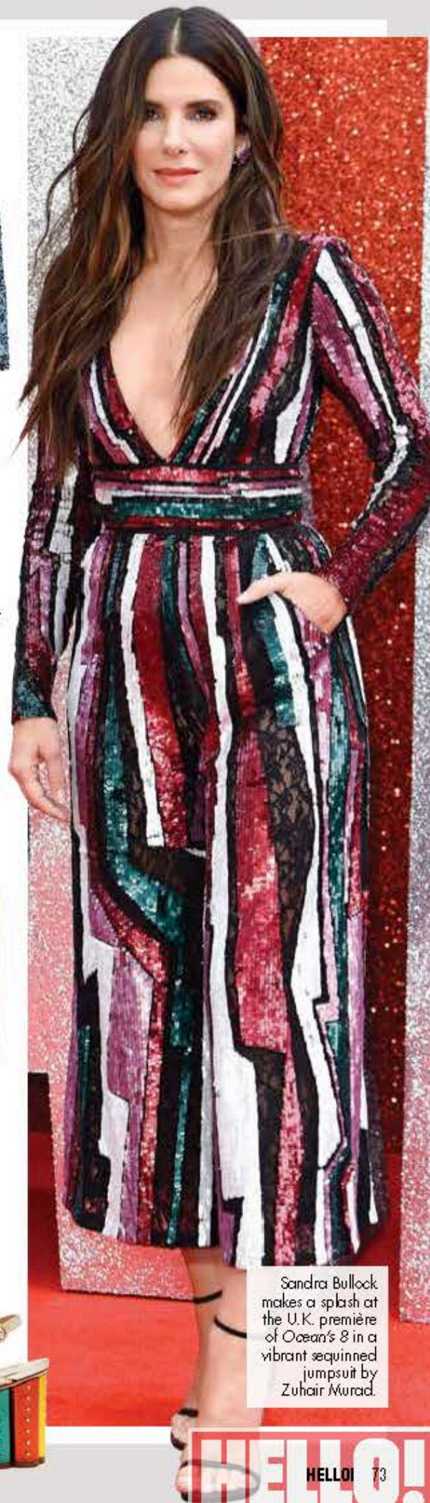
Sandra Bullock makes a splash at the U.K. premiere of Ocean's 8 in a vibrant sequined jumpsuit by Zuhair Murad.