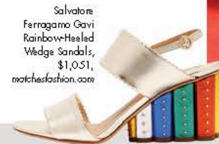
Salvatore Ferragamo Gavi Rainbow-Heeled Wedge Sandals, $1,051, matchesfashion.com