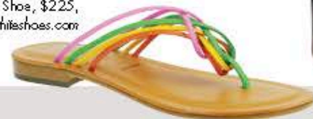
Francis Shoe, $225, ronwhiteshoes.com