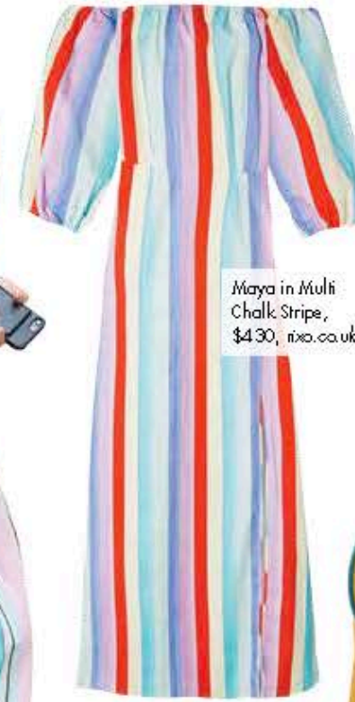
Maya in Multi Chalk Stripe, $430, rixo.co.uk