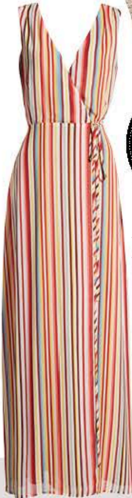
WAYF Bobby Wrap Maxi Dress, $69, nordstrom.com