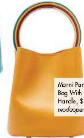
Marni Pannier Bucket Bag With Rainbow Handle, $3,130, modaoperandi.com