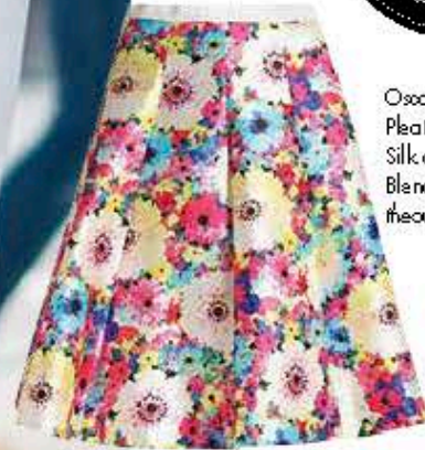
Oscar de la Renta Pleated Floral-print Silk and Cotton Blend Skirt, $754, theoutnet.com

STYLE TIP Get more mileage out of bright solid pieces by pairing them with rainbow-coloured separates.