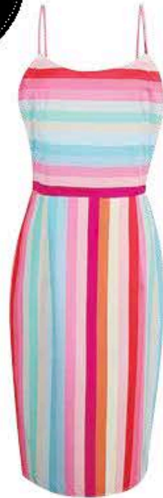
Spaghetti Strap Dress, $21, ebay.ca