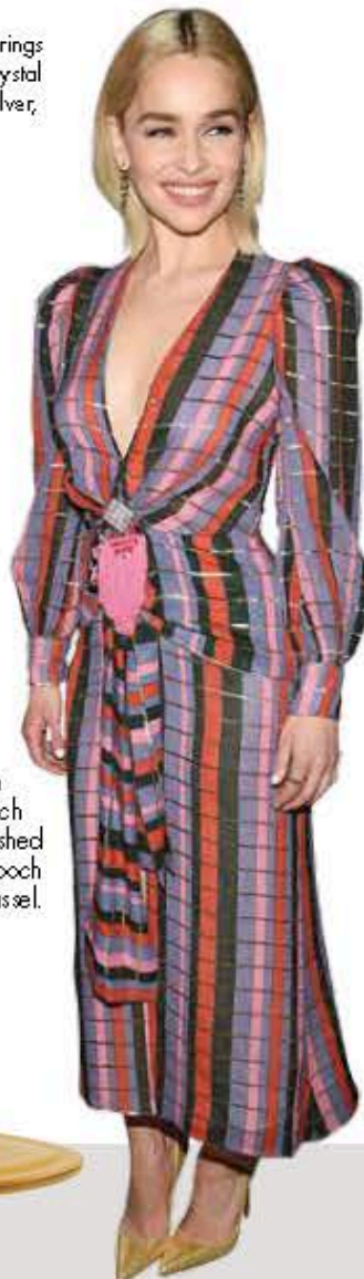
Emilia Clarke takes on the trend in an Alessandra Rich dress embellished with a brooch and tassel.