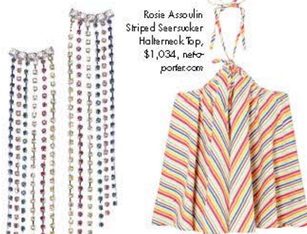
Rosie Assoulin Striped Seersucker Halterneck Top, $1,034, net-a-porter.com

STYLE TIP Get more mileage out of bright solid pieces by pairing them with rainbow-coloured separates.