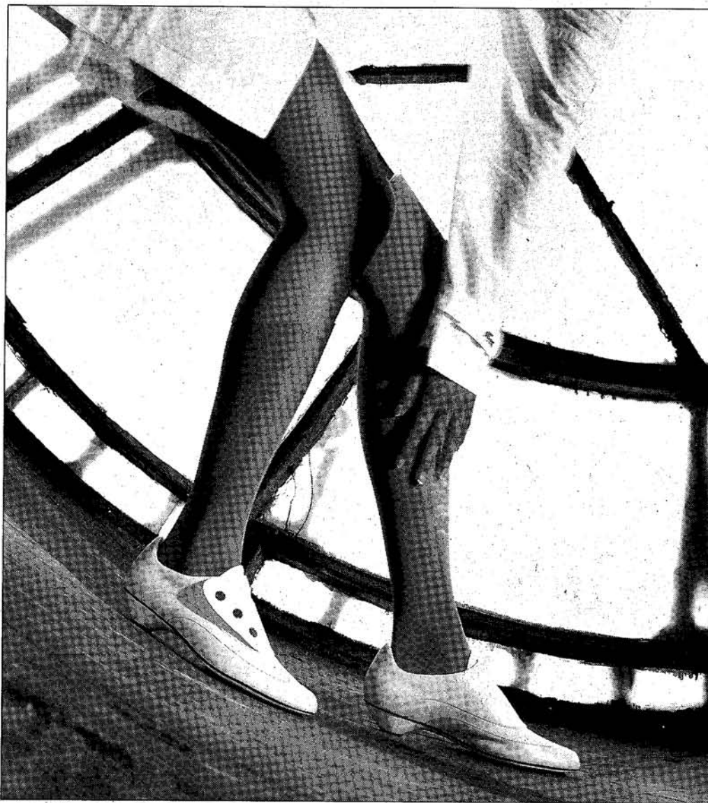
Retro-styled cone-heeled leather shoes with snap closures from the new Vert Femme collection, $355, by Lacoste, available next month, call 1-866-711-6091 ext. 225.

Well, sort of. The selection, with nothing higher than $45, includes silver gladiator sandals that scream Alexander McQueen and slides with turquoise stones à la Michael Kors. But when we asked for photos to run with this story,