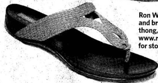
Ron White woven and braided leather thong, $285, see www.ronwhite.ca for stores.