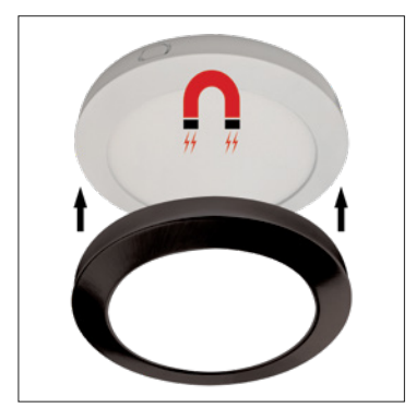
Matte Black Magnetic Trim for CTK models (FJX-R7-BL, FJX-R9-BL)