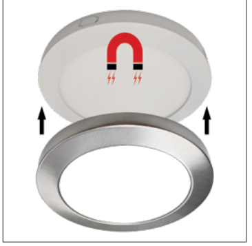
Satin Nickel Magnetic Trim for CTK models (FJX-R7-NC, FJX-R9-NC)