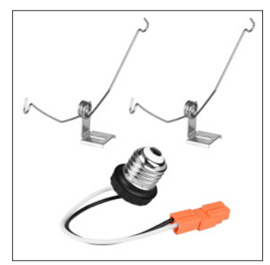
Torsion Clip Kit (FJX-TRK-56)