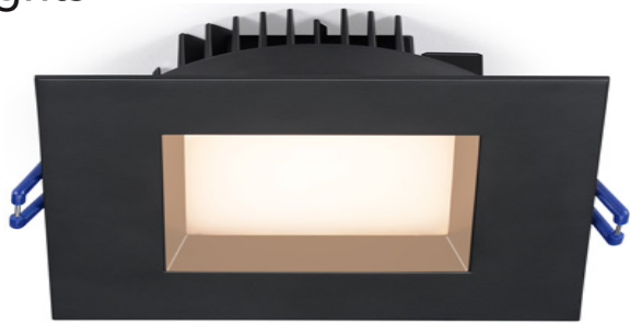
Type IC, Air-Tight, Wet & Plenum