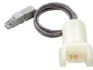
Linear Handheld Programming Tool

The OT Programmer works with the programming tools shown below.