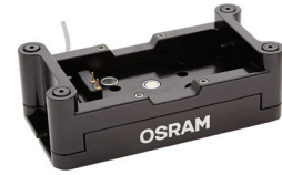
Compact Programming Tool