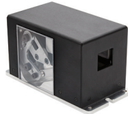
Linear Auto Programming Tool