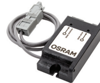
Outdoor Programming Tool