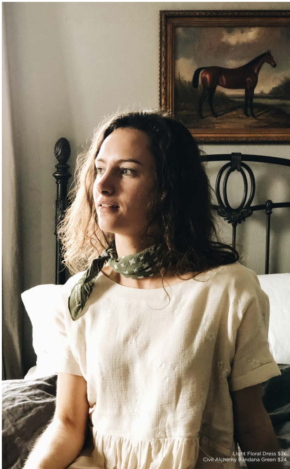
Light Floral Dress $76 Civil Alchemy Bandana Green $24