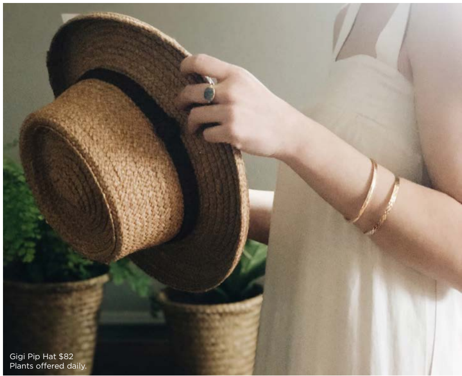
Gigi Pip Hat $82 Plants offered daily.