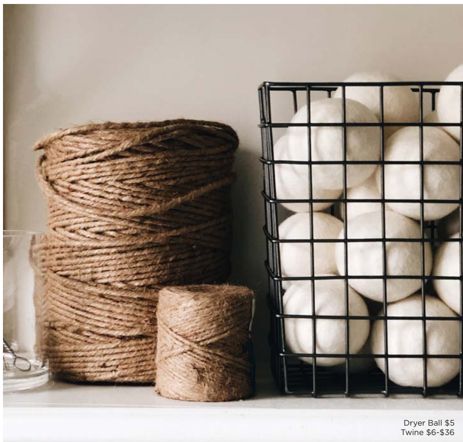
Dryer Ball $5 Twine $6-$36