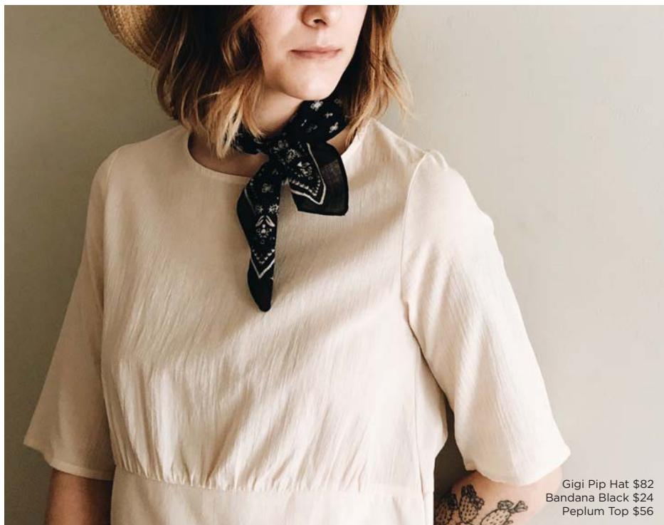
Gigi Pip Hat $82 Bandana Black $24 Peplum Top $56