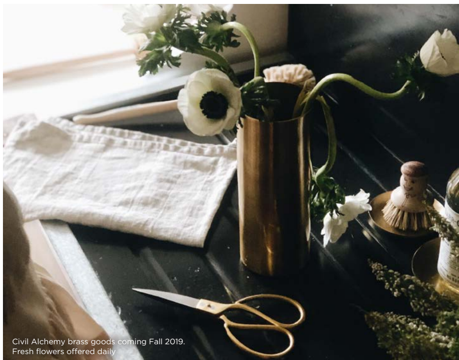
Civil Alchemy brass goods coming Fall 2019. Fresh flowers offered daily