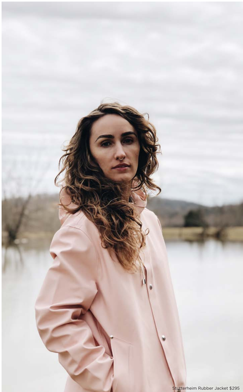
Stutterheim Rubber Jacket $295