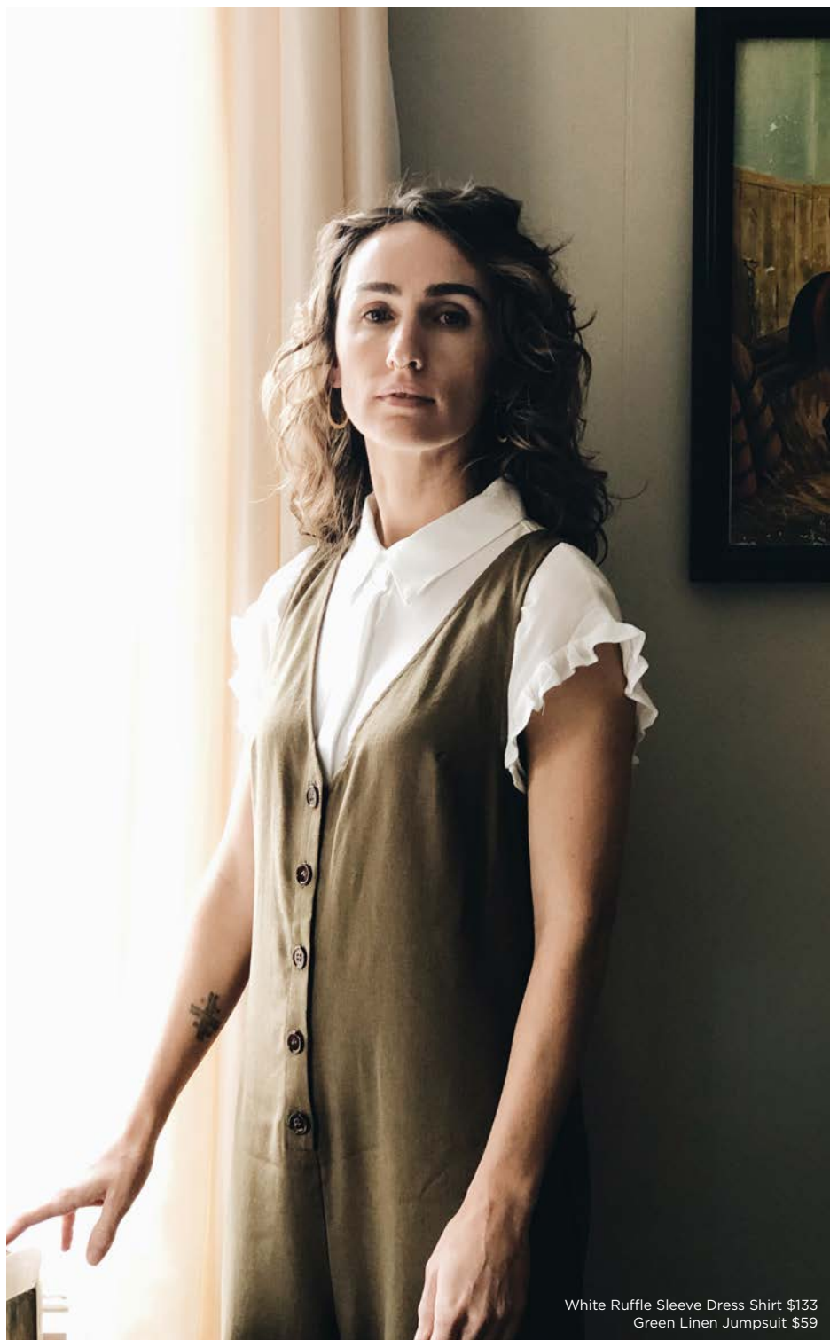
White Ruffle Sleeve Dress Shirt $133 Green Linen Jumpsuit $59