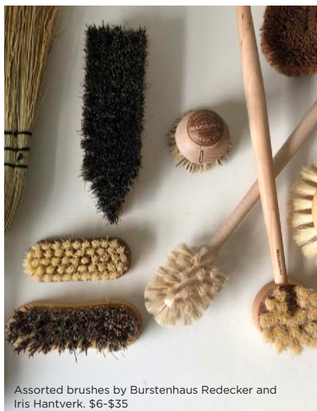
Assorted brushes by Burstenhaus Redecker and Iris Hantverk. $6-$35