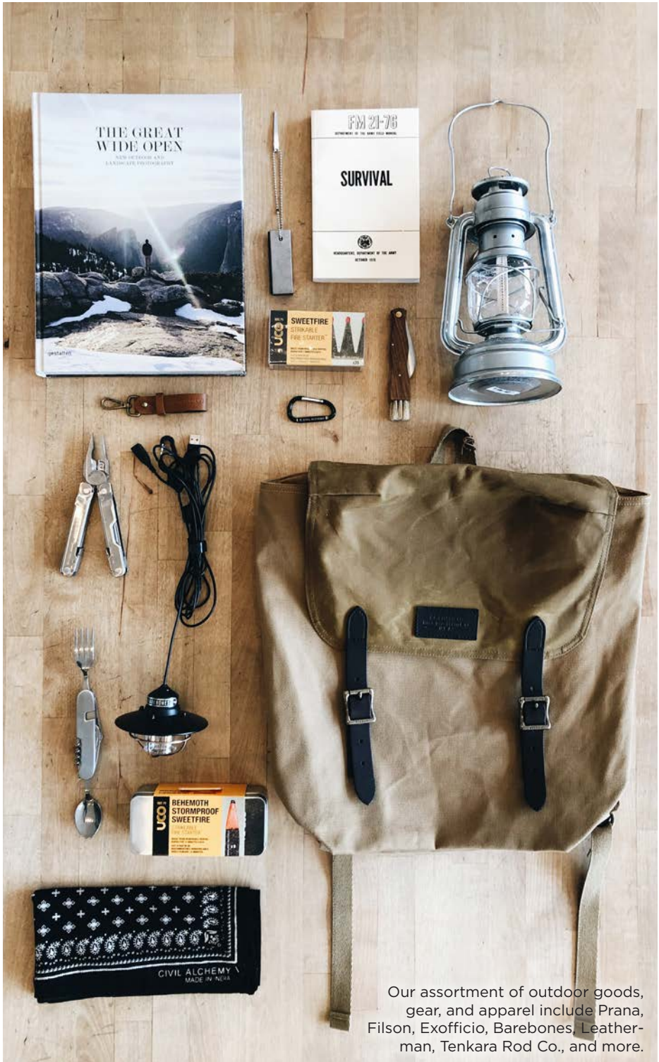
Our assortment of outdoor goods, gear, and apparel include Prana, Filson, Exofficio, Barebones, Leatherman, Tenkara Rod Co., and more.