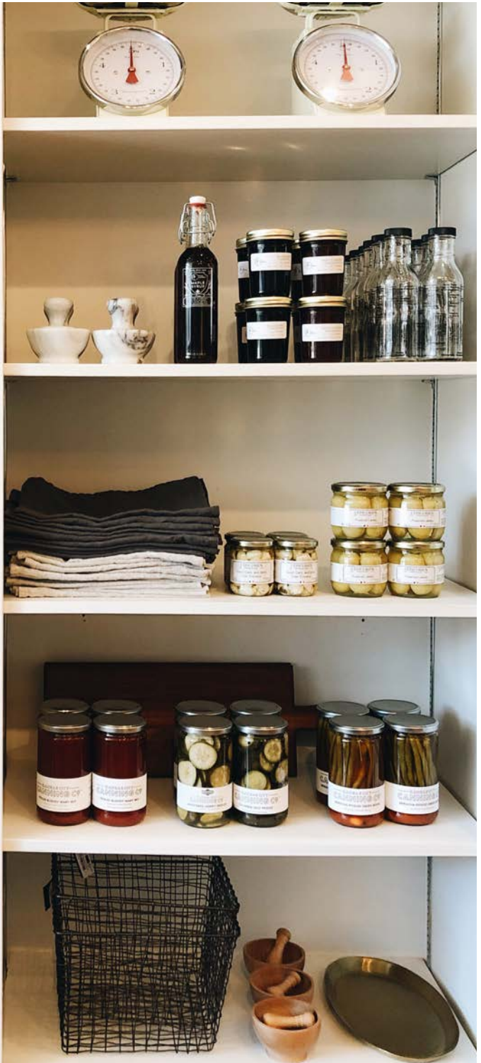
Small Foods $5-$25