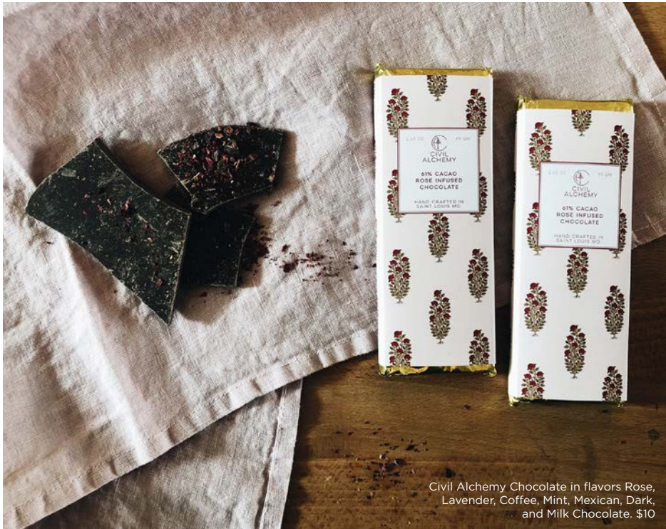
Civil Alchemy Chocolate in flavors Rose, Lavender, Coffee, Mint, Mexican, Dark, and Milk Chocolate. $10