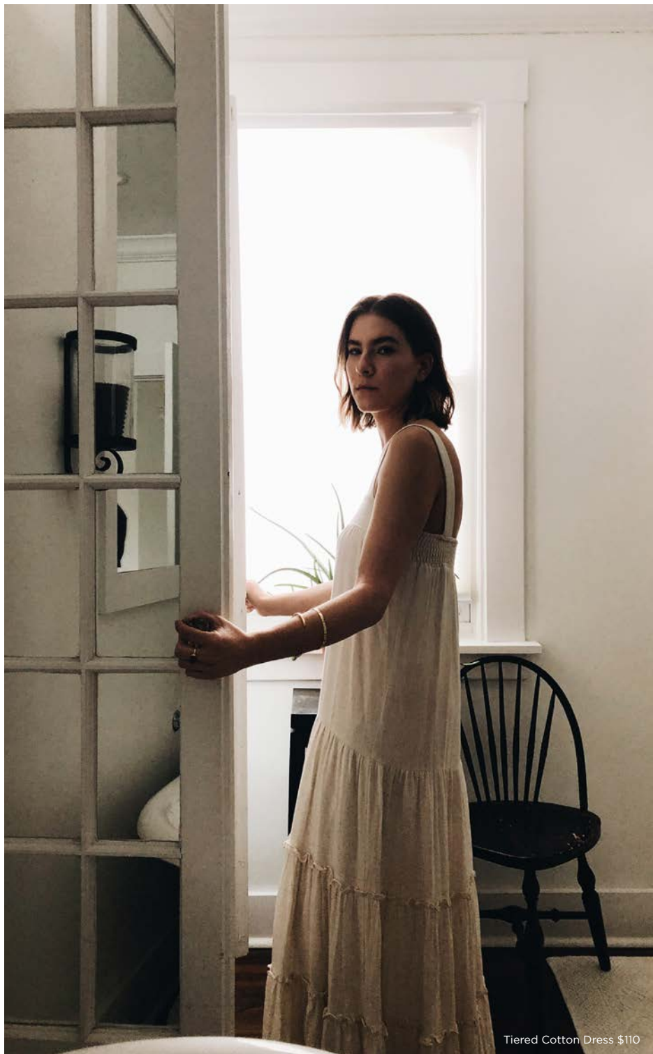
Tiered Cotton Dress $110