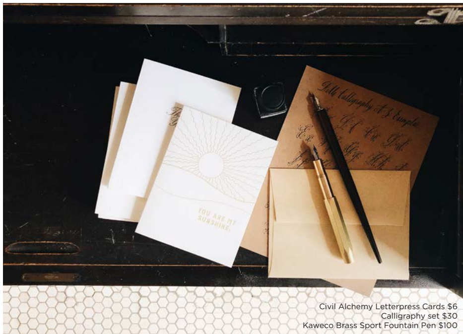
Civil Alchemy Letterpress Cards $6 Calligraphy set $30 Kaweco Brass Sport Fountain Pen $100