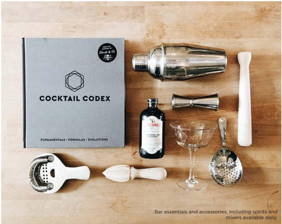
Bar essentials and accessories, including spirits and mixers available daily.