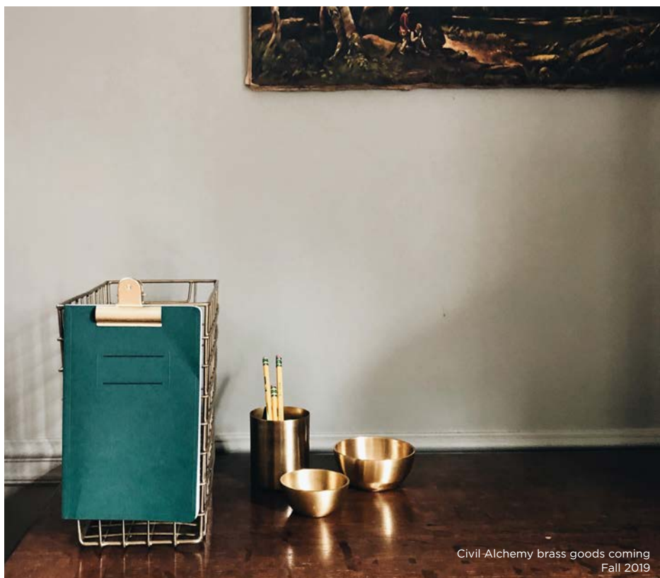
Civil Alchemy brass goods coming Fall 2019