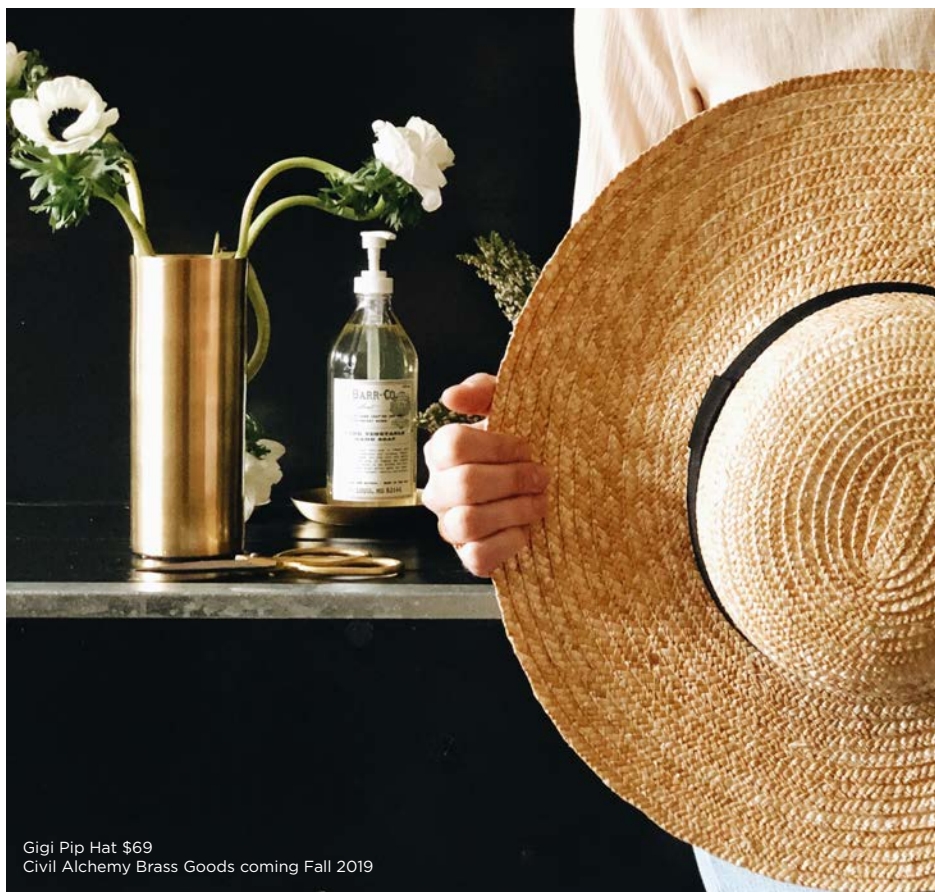
Gigi Pip Hat $69 Civil Alchemy Brass Goods coming Fall 2019