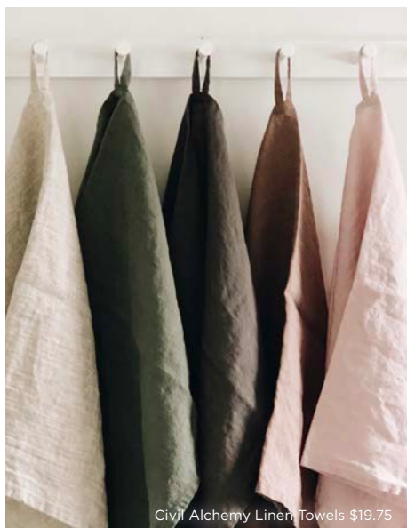
Civil Alchemy Linen Towels $19.75