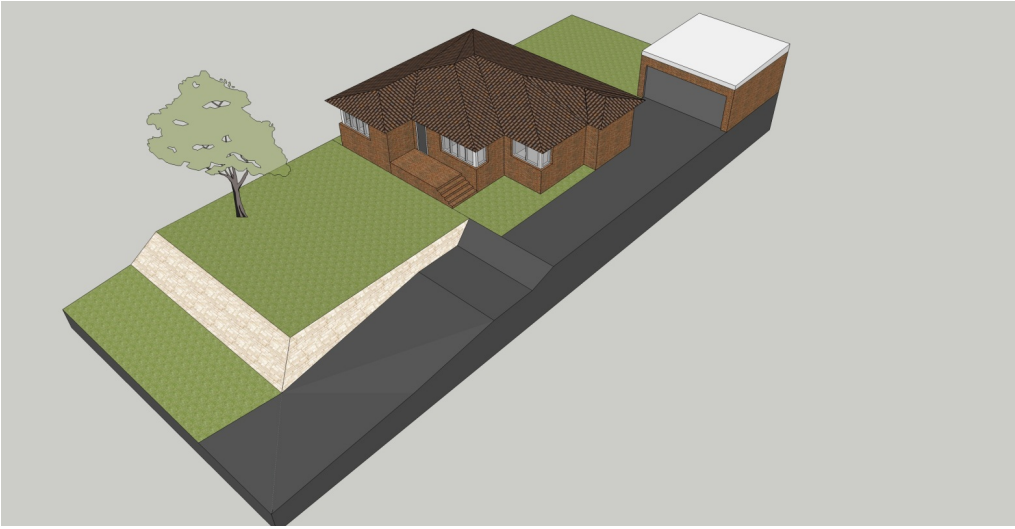
PLAN – “AFTER”