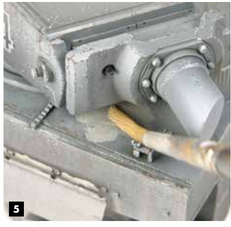
Make dust "clouds" in the horizontal surfaces, specially around the details, turret, hatches, etc. Blend it with clean turpentine and a brush.