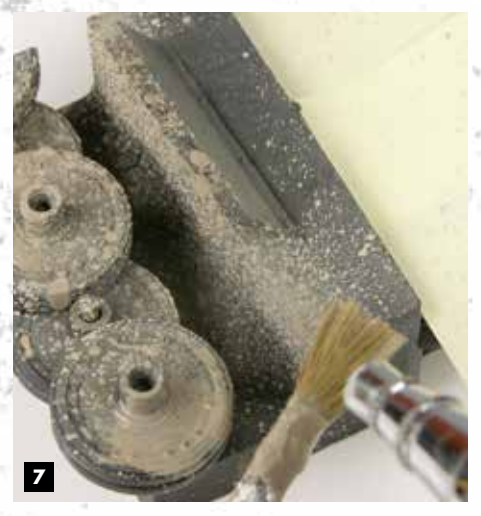
Time to enjoy. Mix the preview dust colors with plaster and project air with your airbrush over an old brush with the mixture. If the mix is too thick, the splashed drops will be bigger.