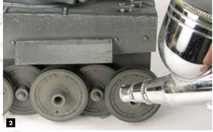
Apply the dust in the lower areas of your model in a randow way and let it dry for 24 hours.