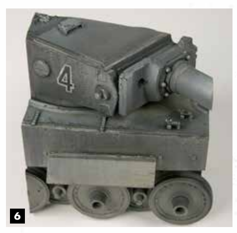
Now we have a nice base to start working with the mud. Remember this preview dust must be lighter than the next mud layers.