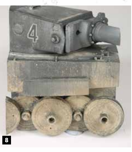
Of course,we must make smaller drops, so the mix must contain more dust product and less plaster. Do it in several layers. Avoid to make this process at once.