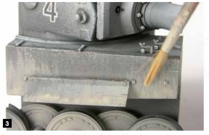
Then, you can paint with a brush small vertical lines by using the same color than in the preview step.