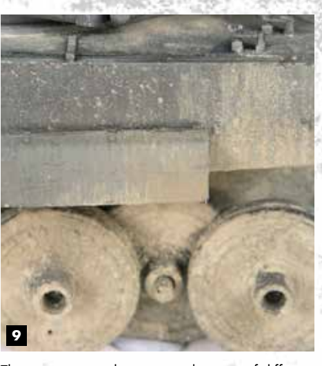
The secret is to achieve a overlapping of different intensities of splashed mud layers. That will create a realistic effect and a better texture. Let dry between layers. Finally, repeat the process using a darker mud color and covering less surface.