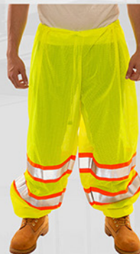
Job Sight™ Class E Two-Tone Pants