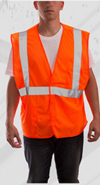
Job Sight™ Class 2 Mesh Vest