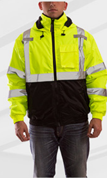
Bomber II Jacket