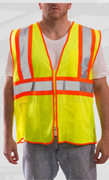
Job Sight™ Class 2 Two-Tone Mesh Vest