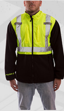
Phase 2™ Jacket