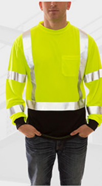
Job Sight™ Class 3 Black Front T-Shirt