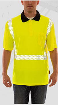
Job Sight™ Class 2 Polo Shirt