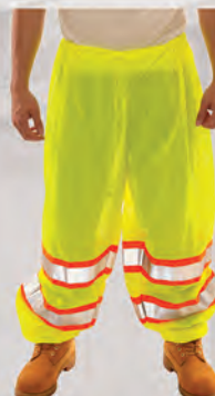
Job Sight™ Class E Two-Tone Pants