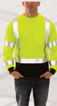
Job Sight™ Class 3 Black Front T-Shirt