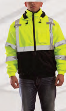
Bomber II Jacket