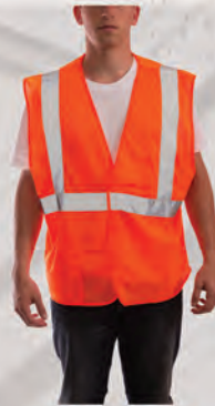
Job Sight™ Class 2 Mesh Vest