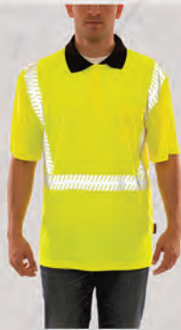
Job Sight™ Class 2 Polo Shirt