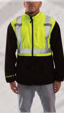
Phase 2™ Jacket