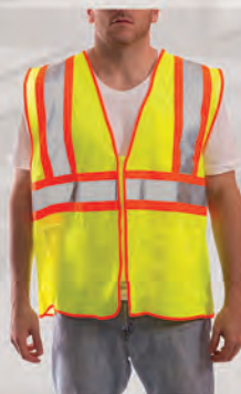
Job Sight™ Class 2 Two-Tone Mesh Vest