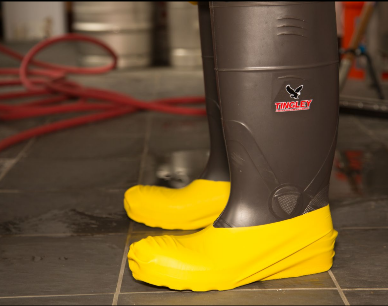
Boot Saver shoe covers are perfect for the color coded world of food processing by helping prevent cross-contamination.