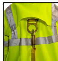
D-ring access for fall protection harness