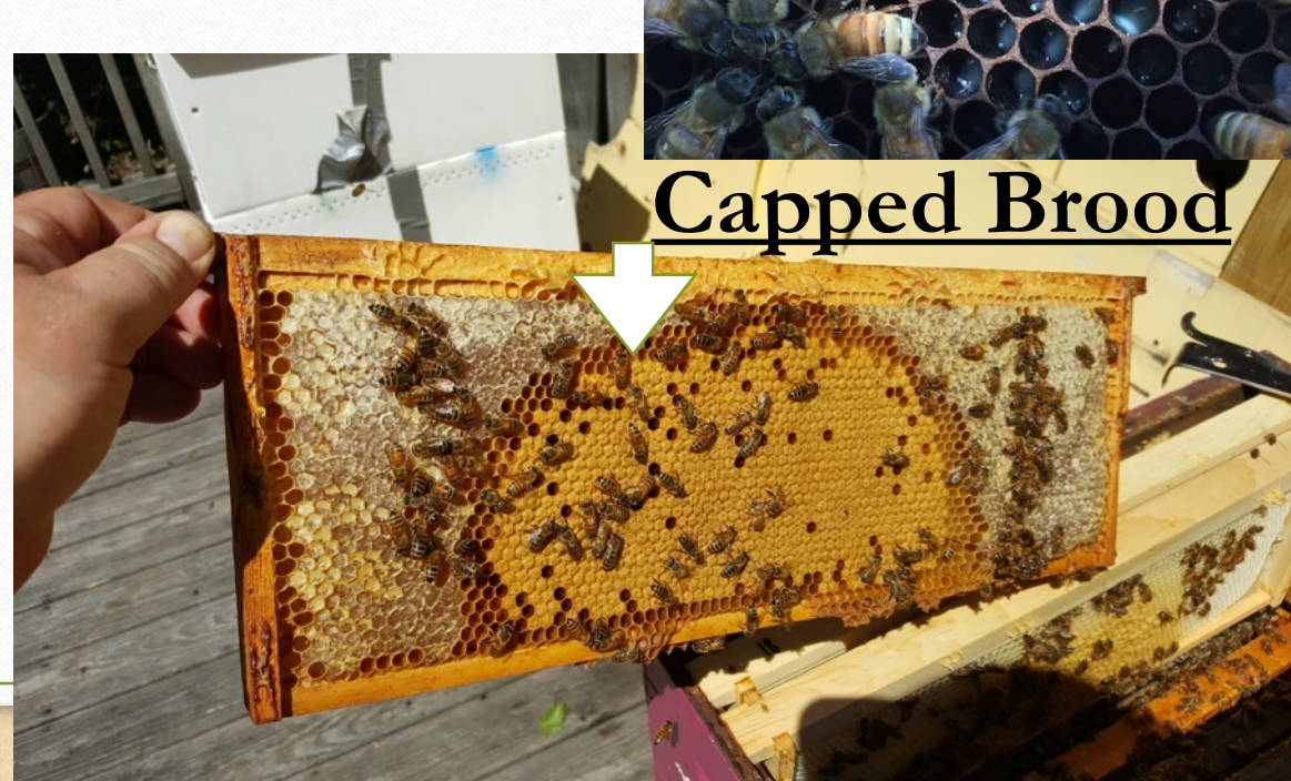
✓ If not, investigate further